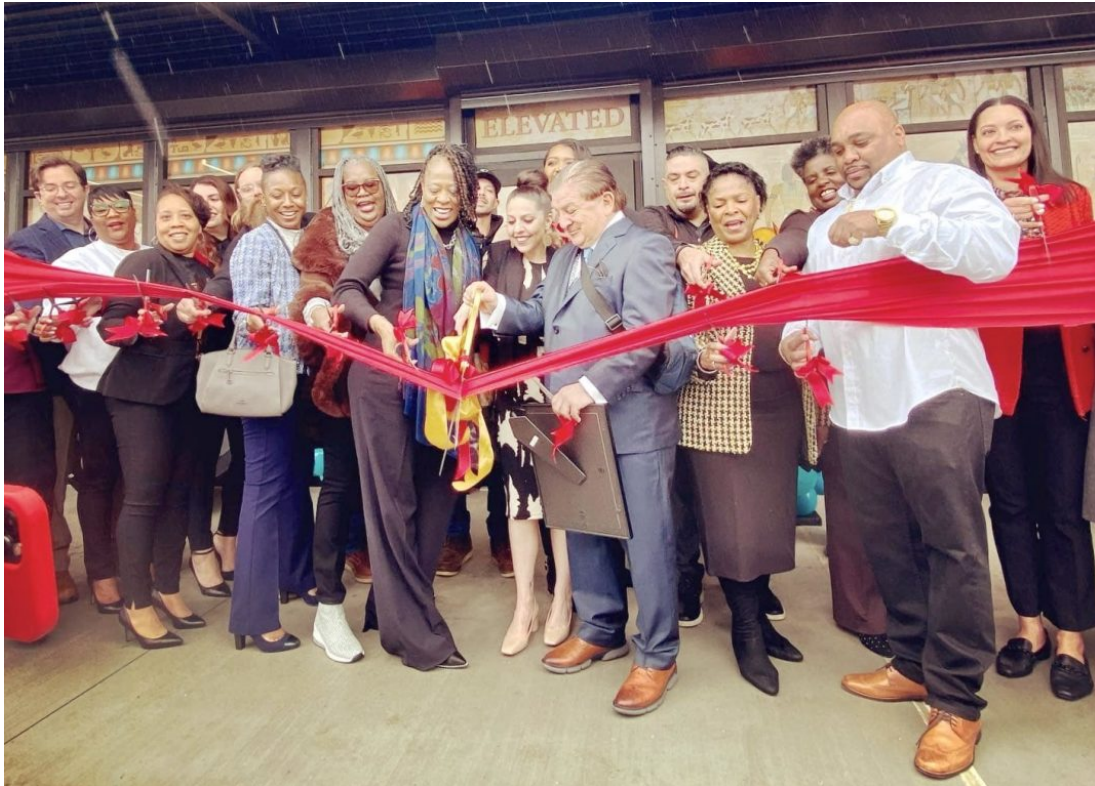
Time for Change Foundation cutting the ribbon on its BBOP Center in March 2023. The space, a Silicon Valley level economic hub for low-income, disenfranchised women to access resources, support, and information they need to become successful entrepreneurs will be a beneficiary of the funds raised at the organizations annual gala on April 14th.